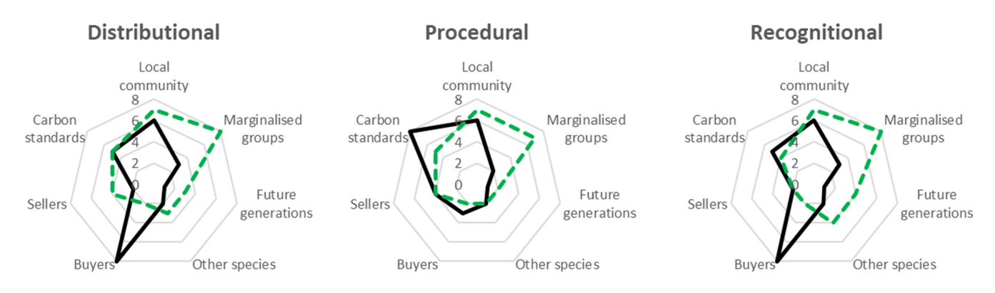
FIGURE 2 Hypothetical current (black line) and 'original' (dashed green) positions for the three dimensions of justice, as applied to seven stakeholder groups involved in the blue carbon projects Mikoko Pamoja and Vanga Blue Forest. For example, the current market gives relatively high recognitional values to buyers (since they are targets for marketing) and much lower ones to future generations and this is not considered to reflect an original position based on justice considerations.